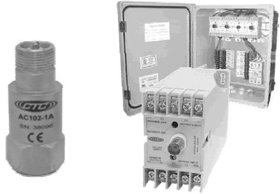
AC102 Series Sensors with Transmitters