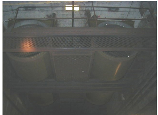
A Pair of Tunnel Jet Fans

Purging of toxic gases with a supply of clean air requires Tunnel Jet Fans. These fans provide longitudinal ventilation of the tunnel and are the primary sources of clean air. Jet fans provide a very high impulse or thrust of clean air into the tunnel and through the tunnel. They are often found in multiple sets mounted on the roof or side wall of the tunnel at selected intervals. The number of fans required is based on tunnel length and design.