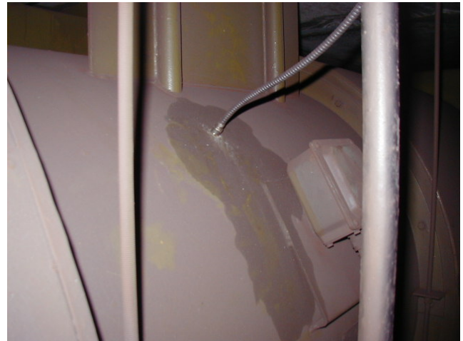
Completed Conduit Connection

Good organization of the wiring will provide robust and understandable wire runs. Each wire should be labeled, and matched to the corresponding sensor.