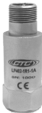
LP400 Series Dual Output Sensors