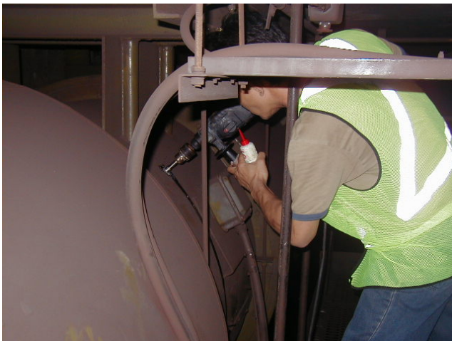
Drilling Access Hole for Conduit

Cable management is also a concern with tunnel fans. Quite often there is a significant amount of air flow and long distances involved from the sensors to the transmitters, or directly to the control room in the case of dual output sensors. Care must be taken and plans put in place to assure that the cables are run in a manner that protects them. Access holes and conduit pipes may be required to protect the cables.