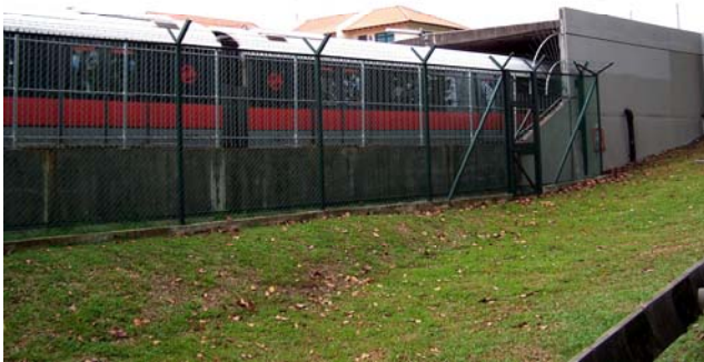
Commuter Train Exiting Underground Tunnel

The world's developing infrastructure creates many technical challenges for engineering and construction. Quite often names like "Chunnel" (English Channel), "Big Dig" (Boston), and "Nam Wan" (Hong Kong) are feats to marvel at as they provide passages underground, underwater, or straight through a mountain for today's highways and rapid transit systems.